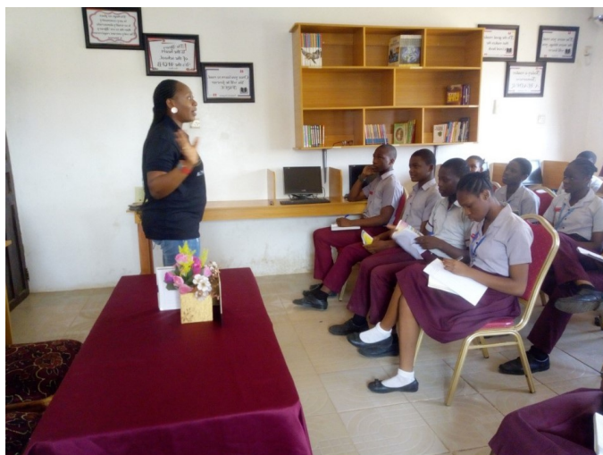
YESHUA HIGH SCHOOL