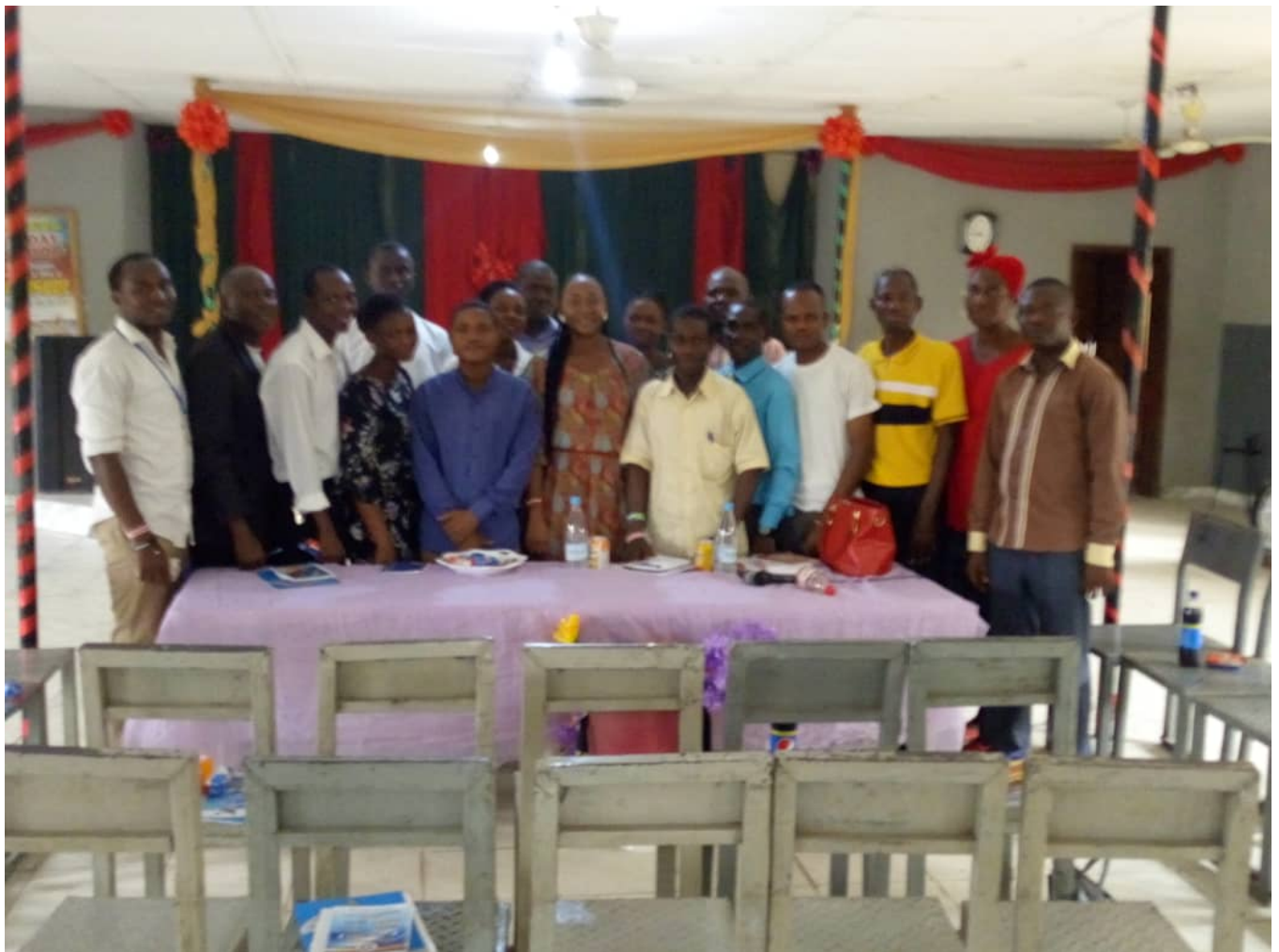
Two PBOF staffs trained staffs of Habitation of Hope, Logunro Mowe on Challenges of Parenting in a Rehabilitation Home, making a Rehabilitation Center a Real Home Away from home and Child Protection Policy for working with children in a Rehabilitation Home.