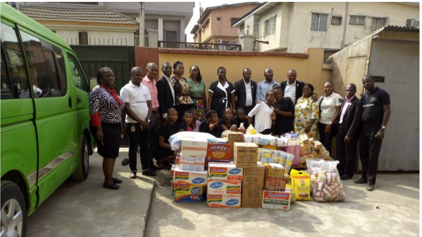
Sweet Sensation visited and donated foodstuffs and toiletries to PBOF as part of their CSR. The items were given to ex-clients who were present during the visitation and Echoes of Mercy and Hope Foundation.