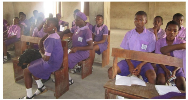
Estate Jnr Grammar School