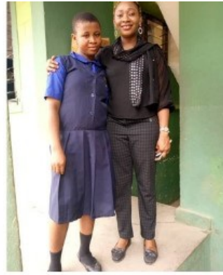
Visitation and Follow-up on Ex-clients