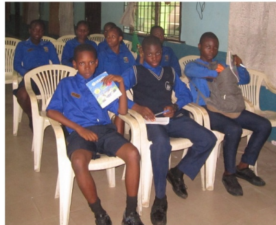
Agbayewa Memorial College