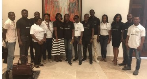
As youth advocates, PBOF attended the MTN Anti-Substance Abuse Project (ASAP) Lagos round table with the theme: Building a Multi-Sectoral, Multi-Stakeholder Approach to Curtailing Substance Abuse.