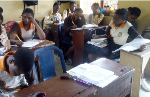
The Nobel College