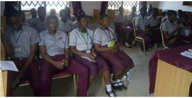
Yeshua High School