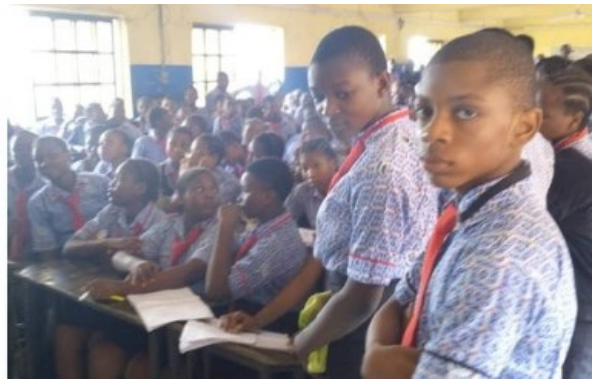
The foundation had pre-valentine talk with students of Living Stone College Ikorodu on self-awareness, love and abstinence.