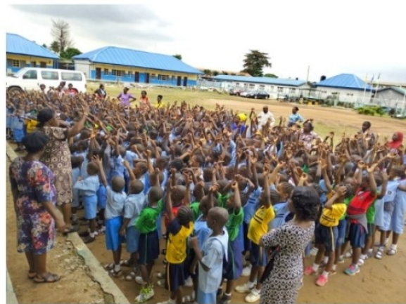
Air Force Primary School

Sexual harassment and other forms of sexual violence in public spaces are an everyday occurrence, in continuing advocacy on prevention and